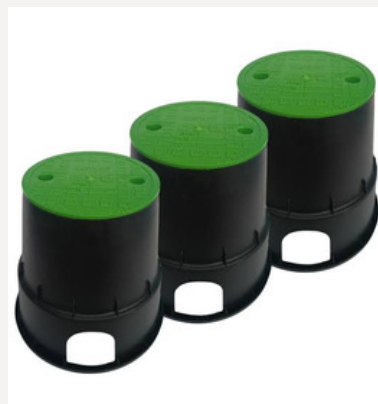
Earth pit cover