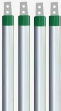
G.I Electric rode