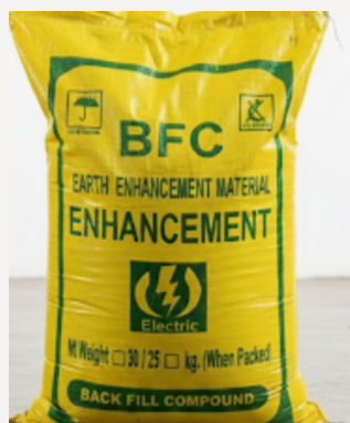
Back Fill compound