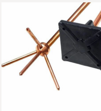
Copper bonded lighting arrestor